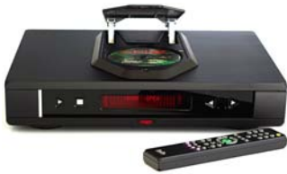
ISIS Reference CD Player