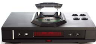
ISIS Valve Reference CD Player